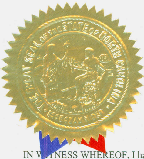
BEVERLY EAVES PERDUE

NOW, THEREFORE, I, BEVERLY EAVES PERDUE, Governor of the State of North Carolina, do hereby proclaim February 2012, as " BLACK HISTORY MONTH " in North Carolina and call upon all citizens of this state to observe and commemorate Black History Month.